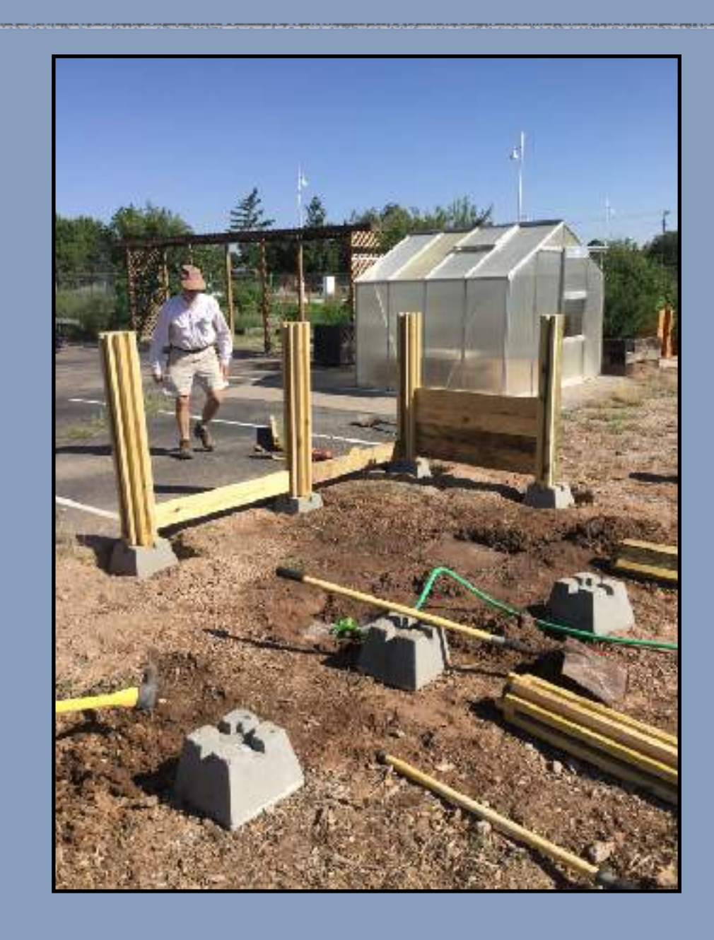
4. Setting, leveling and squaring of side support posts