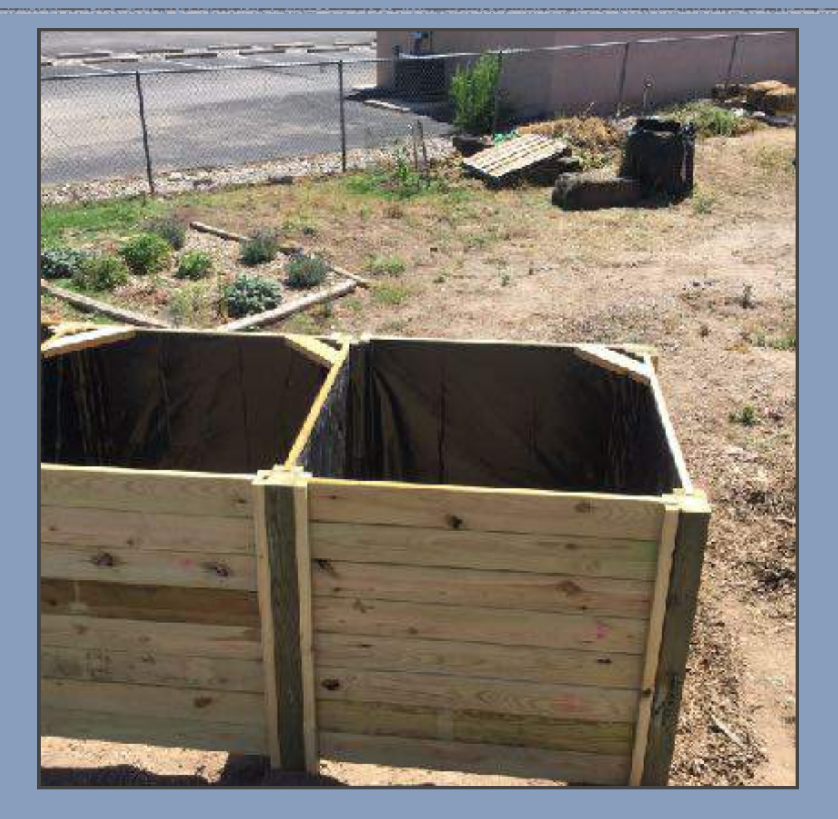
11. Finished! note the pieces of 2X4 used the brace the rear corners of each bin for stability