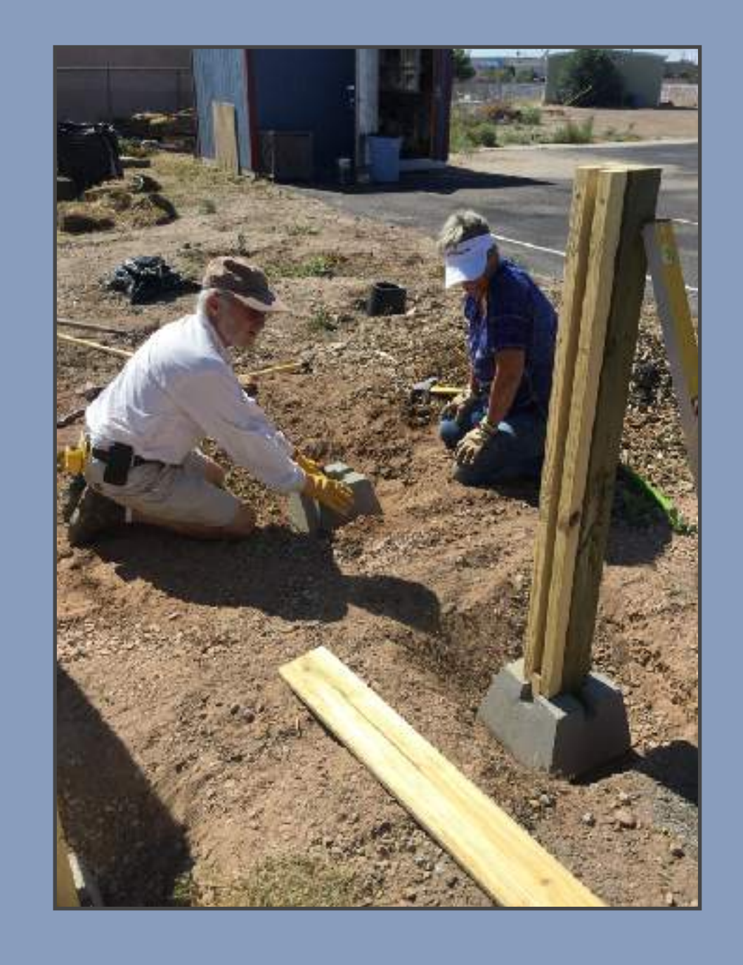
5. Hurray! The last deck block is set in place. The ground was very hard and rocky, making it an arduous task to get the blocks placed and leveled